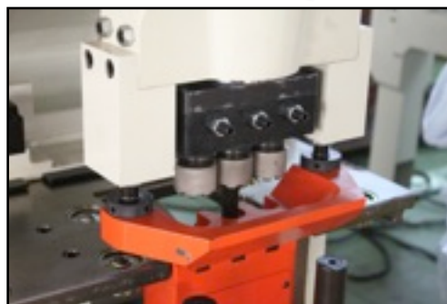
Triple Punch Attachment.