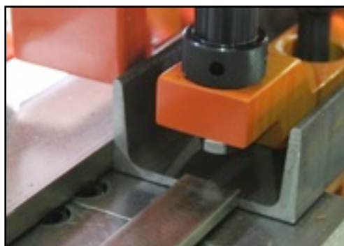
Channel Punching Automation.