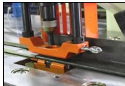
Angle Leg-Up Punching Automation.